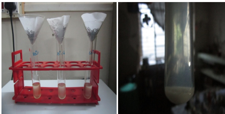
Figure-2 Extracted Polysaccharide Content of Chia Seeds

Nutrient Analysis of chia seeds: The experimental procedure for determination of nutrient composition of chia seeds was carried out by AOAC gravimetric method. The chia was milled to the particle size of 0.5 – 1 mm in a Wiley mill. The dry matter content of chia is determined as the weight after drying of 5 hour at 105°C. Extraction of Liquidsis recommended for chia containing more than 5 percent of lipids to facilitate the subsequent removal of free sugars by ethyl alcohol extraction. Add 50 ml of boiling 80 percent ethyl alcohol, stir well and centrifuge at 2000 rpm for 5 minutes. The nutrient content of chia is to be estimated, and then collected the ethyl alcohol extract quantitatively.