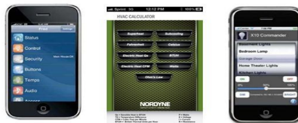
Figure-1 Some Smart Phone application for controlling devices

The advent of internet has opened up new opportunities to offer a person more control on smart homes while a person away from home. Using web service, a person not only can monitor and control his home devices from anywhere at any time but also takes care of his loved one lived behind home. Location Based Services and Cloud Computing are technologies that have significantly impacted our daily life in a positive way, also beneficial in controlling smart home features remotely 18 . In order to control the home remotely, home automation standards either have been updated and/or new modules were added or completely revised to take complete advantages of internet based home care and control. In recent past, this feature is accessible through desktop computers with internet connectivity however, the invention of Smartphone with internet connection changes the situation dramatically and one can now control his home devices while he was travelling or enjoying a picnic at beach.