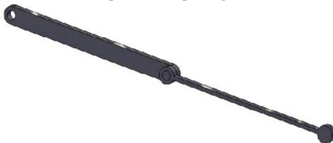
Figure-2 Proposed optimized shape