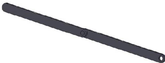
Figure-1 Unoptimized shape (original)