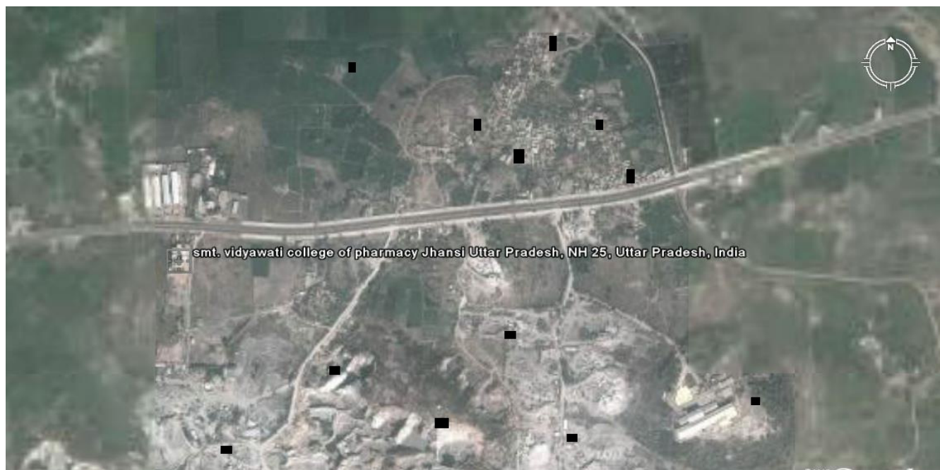
Figure-3 Sampling areas of Goramachia village in Badagaon mandal, Jhansi District

Climate: Being on a rocky plateau, Goramachia experiences extreme temperatures. Winter begins in October with the retreat of the Southwest Monsoon (Goramachia does not experience any rainfall from the Northeast Monsoon) and peaks in mid-December. The mercury generally reads about 4 degrees minimum and 21 degrees maximum. Spring arrives by the end of February and is a short-lived phase of transition. Summer begins by April and summer temperatures can peak at 47 degrees in May.