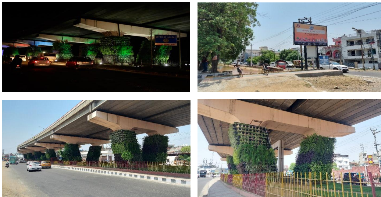
Figure-3: Some ongoing Projects executed under Jammu Smart City*.