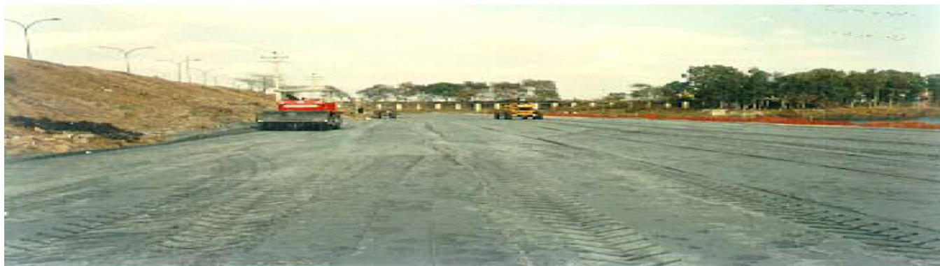
Figure-4 Nizamuddin Bridge approach road embankment at New Delhi (in flood zone of river Yamuna)

Utilization of fly ash will not only minimize the disposal problem but will also help in utilizing precious land in a better way. Construction of road embankments using fly ash, involves encapsulation of fly ash in earthen-core or with RCC facing panels. Since there is no seepage of rain water into the fly ash core, leaching of heavy metals is also prevented. When fly ash is used in concrete, it chemically reacts with cement and reduces any leaching effect. Even when it is used in stabilization work, a similar chemical reaction takes place which binds fly ash particles. Hence chances of pollution due to use of fly ash in road works are negligible 21 .