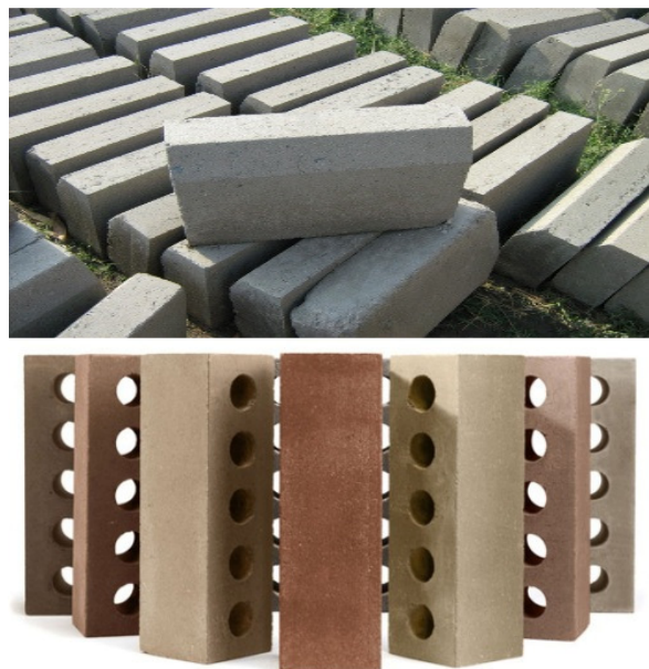
Figure-1 Fly ash using for making bricks

Fly ash in manufacture of cement: In the presence of moisture, fly ash reacts chemically with calcium hydroxide and CO 2 present in the environment attack the free lime causing deterioration of the concrete. A cement technologist observed that the reactive elements present in fly ash convert the problematic free lime into durable concrete 15 . Fly ash can substitute up to 66% of cement in the construction of dams. Fly ash in R.C.C. is used not only for saving cement cost but also for enhancing strength and durability. Fly ash can also be used in Portland cement concrete to enhance the performance of the concrete. Portland cement is manufactured with Calcium oxide, some of which is released in a free state during hydration. Studies show that one ton of Portland cement production discharges 0.87 tonnes of carbon dioxide in the environment. Another Japanese study indicates that every year barren land approximately 1.5 times of the Indian Territory need to be afforested to compensate for the total global accumulation of carbon dioxide discharged into the atmosphere because of total global cement production. Utilization of fly ash in cement concrete minimizes the carbon dioxide emission problem to the extent of its proportion in cement.