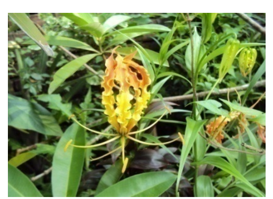
Figure-14 G. superba