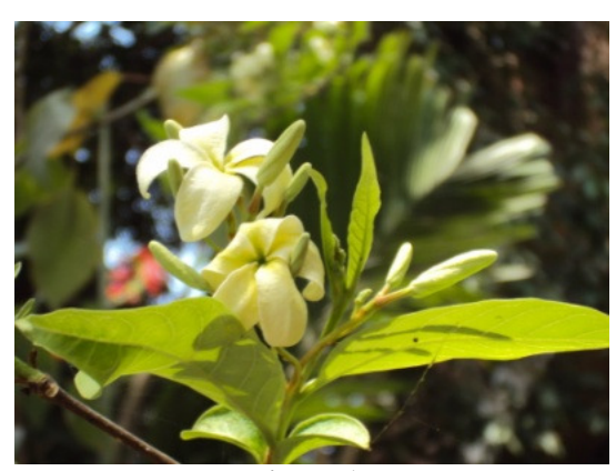
Figure-15 H. pubescensis

Tribal and non-tribal people of the district use one plant for curing only one or more ailments. In some cases, along with the other plant parts and a few amount of salt, sugar, sugar candy, jaggery, piper, turmeric powder, black pepper, honey and cream was used. On the other hand, at instance lukewarming, heating, boiling and roasting is also recommended to enhance the efficacy of the remedies or make it more palatable for oral consumption. It was observed that the parts of medicinal plant