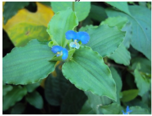
Figure-8 C. benghalensis