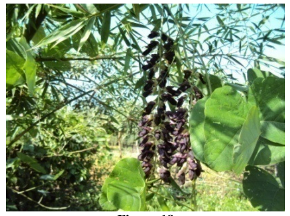
Figure-18 M. pruriens

The relations between numerical uses of plants with respect to ailments have been presented in table-2. The table-2 interestingly show that for treatment of gastrointestinal problems 34 plants are used which is highest with respect to number of plants used.