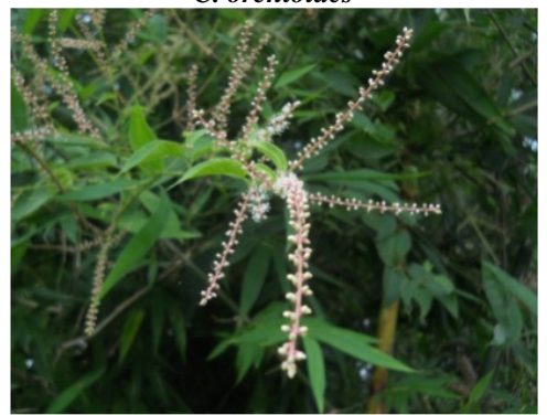
Figure-11 D. amaranthoides