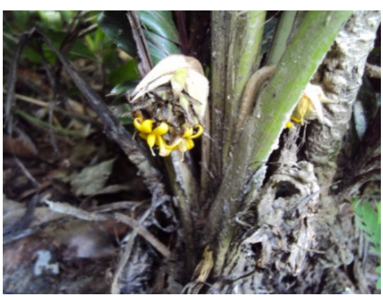
Figure-17 M. capitulata