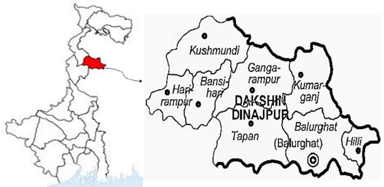
Figure-1 Location map of the survey area (Dakshin Dinajpur district)

Dakshin Dinajpur of West Bengal is a small agriculturally active district having 8 blocks, where most of the rural people still use the medicinal plants as their remedies for different ailment. The district Dakshin Dinajpur lies between 26° 35' 15" N to 25° 10' 55" N latitude and 89° 00' 30" E - 87° 48' 37" E longitude and covering an area of 2162 Sq. Km. (Figure-1). There are five tribal communities such as Santal, Munda, Oraon, Lodha, Sabar, which are about (16.12%) of total population. Along with these tribes, the other non-tribal population belongs to other category such as Rajbanshis (18.4%), Hindus, Mushlims and other minorities. This district has also a very old tradition of practicing Kabiraji, Ayurveda and Unani.