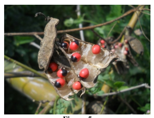
Figure-5 A. precatorius