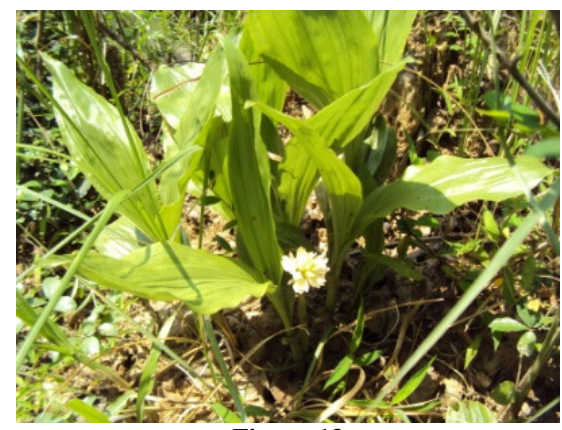
Figure-13 G. densiflorum