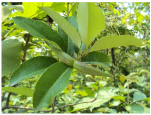
Figure-9 C. buchananii