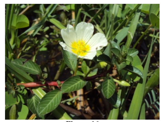
Figure-16 L. ascendens

are utilized in the form of decoction, juice, infusion and pastes for external use.